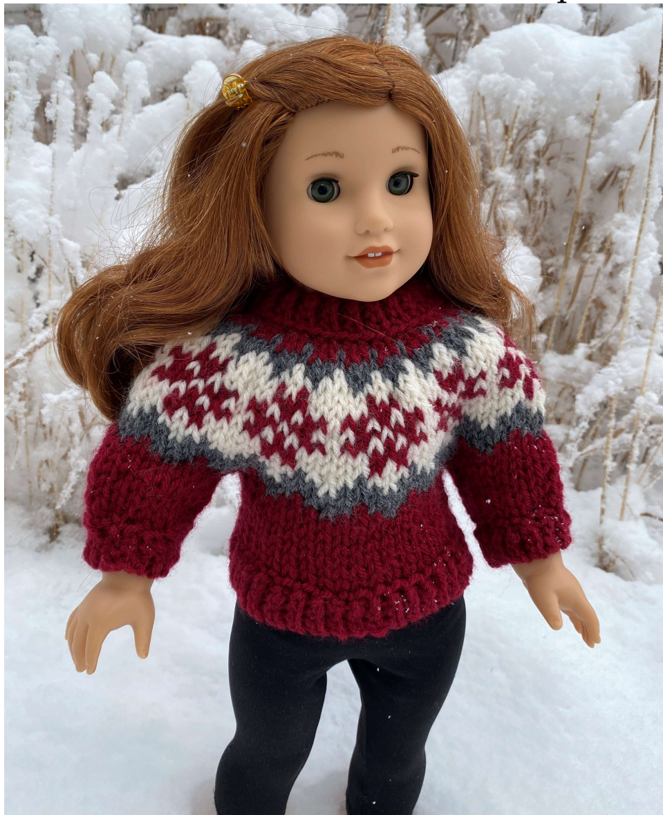
Pictured on American Girl Blaire