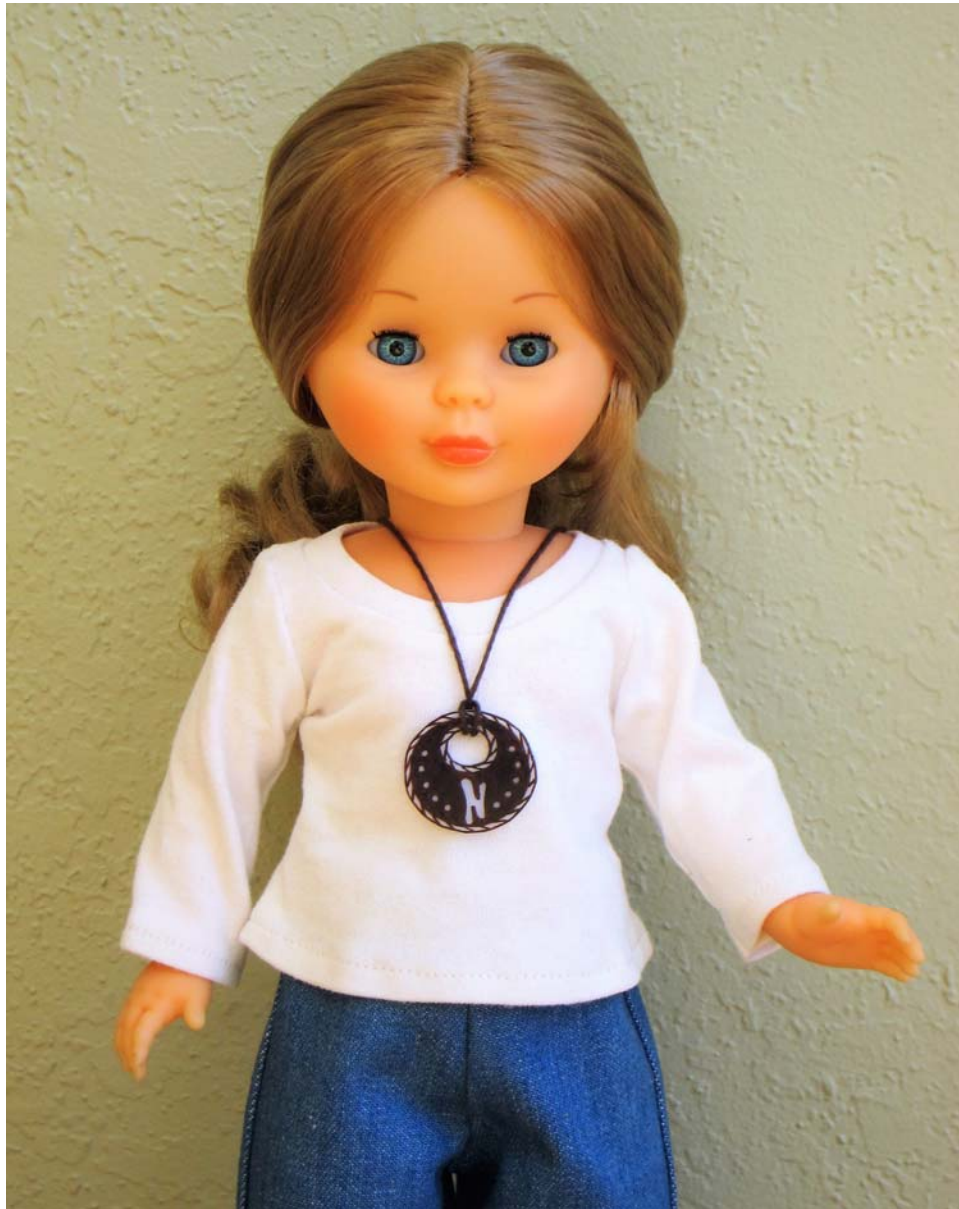
Reproduction Nancy Famosa

I assume you have basic sewing knowledge and the explanation should suffice, but if you need help please email me!