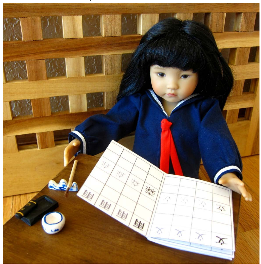
Little Darling learns to write kanji

I assume you have basic sewing knowledge and the explanation should suffice, but if you need help please email me! Quarter inch seams allowed unless otherwise specified.