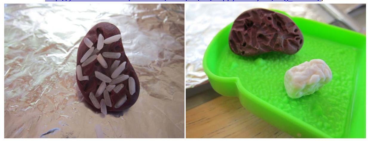
Make a texture block: press uncooked rice into a piece of soft clay randomly until you get a pattern you like. Bake as per package directions. (You may have something else that would work too, like the playdoh bread mold shown here). Press the mold into blocks of white mixed with translucent.

Also often served is Chirashizushi. I based these on Orcara miniatures (see them here: http://jenwrenne.wordpress.com/2013/01/01/happy-new-year/img 7774r1/)