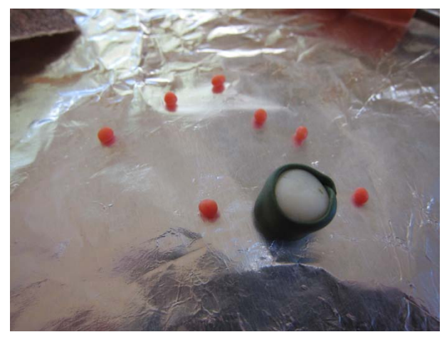
Wrap "Nori" around a ball of translucent and make little balls for the top. Use extra "fish" color to make a ginger flower and leftover green from the mochi for wasabi.