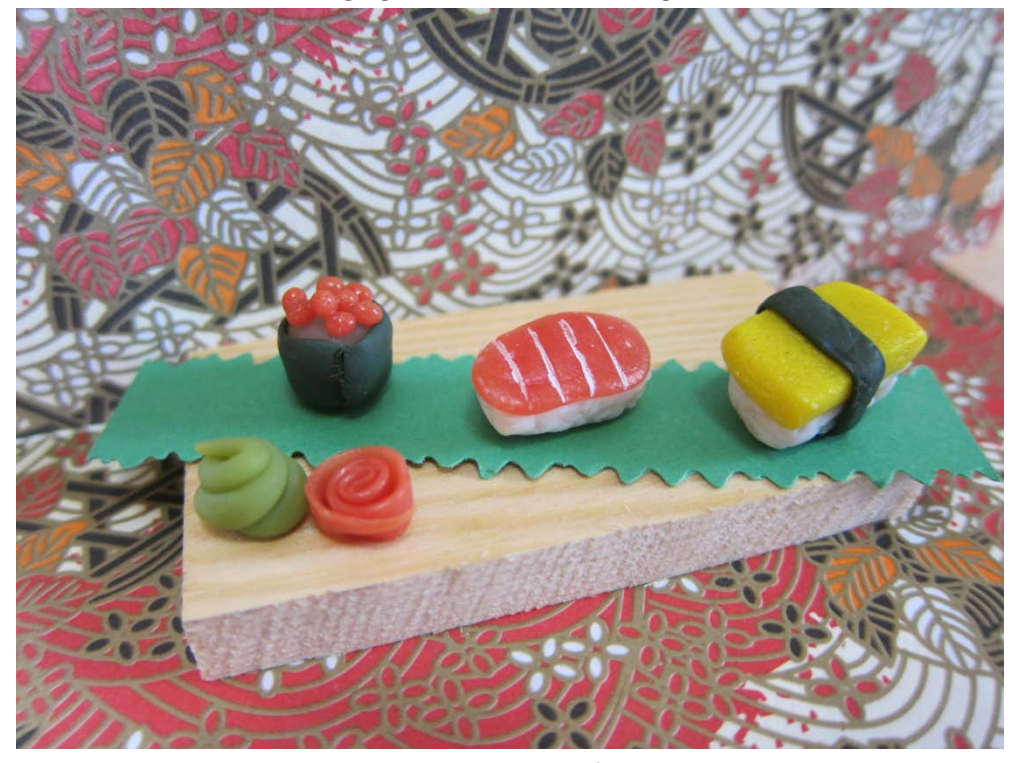
Varnish things that should be shiny in real life. I use acrylic paint varnish.