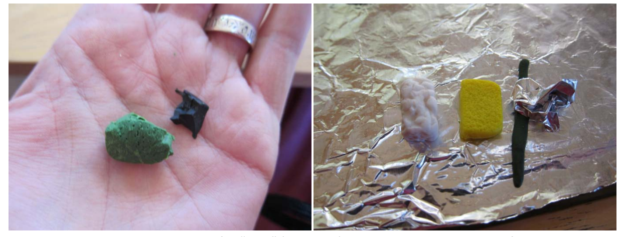
Mix green and black for "Nori" (seaweed) and texture with crumpled foil